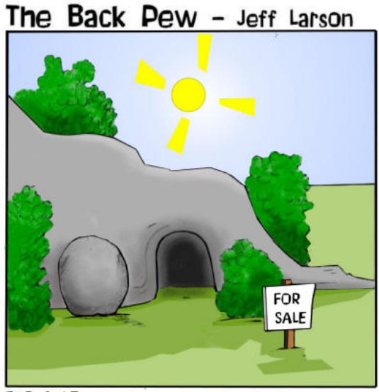
FOR SALE - Single owner tomb. Only used three days, and still has that new tomb smell. Reason for sale.. resident was resurrected.

He rules the world with truth and grace, and makes the nations prove The glories of his righteousness And wonders of His love, and wonders of His love, And wonders, wonders of His love.