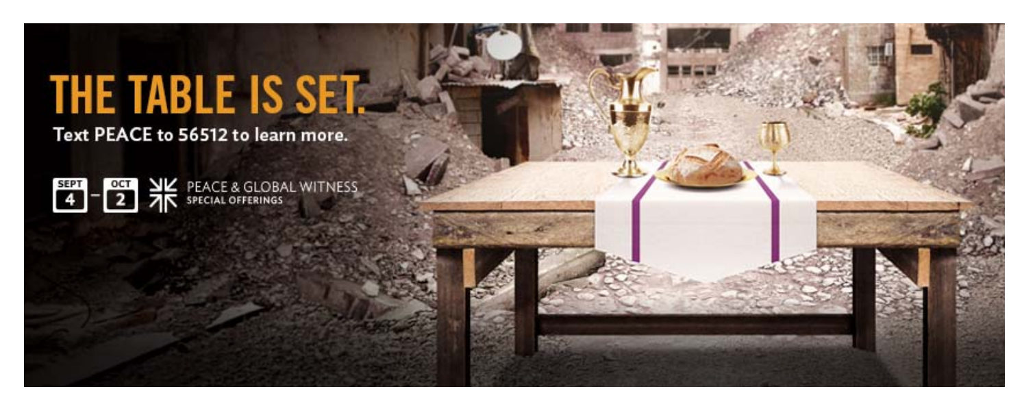
Peace and Global Witness Offering

The Peace and Global Witness Offering, formerly the Peacemaking Offering, exists to ignite Presbyterians in their Christian response to violence in our world toward making a more peaceful world. On October 2, "World Communion Sunday," we will bless our Peace and Global Witness offering [formerly titled The Peacemaking Offering].