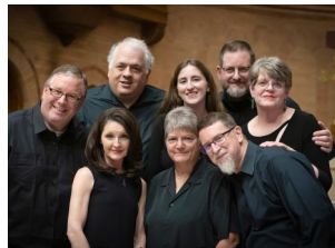
The Lyric Consort