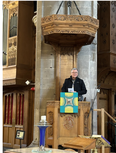
A Guest Preacher in the pulpit of St. John's Kirk, Perth, Scotland.